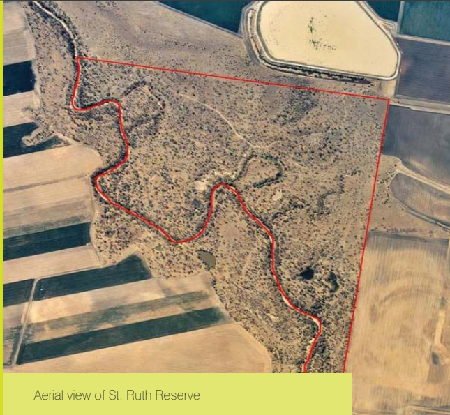
Aerial view of St. Ruth Reserve