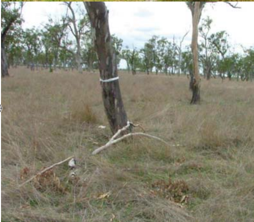
The top photo (1999) shows the mass of lippia groundcover prior to destocking. The bottom photo was taken in 2004, 5 years after destocking. The main species is Queensland Bluegrass