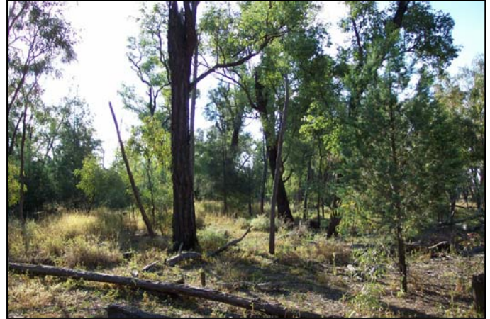
Picture 4: Mature regrowth providing logs on ground on Dunkerry South

Selective thinning offers a number of benefits. From a production perspective, it reduces the competition from trees and improves grass growth and carrying capacity. It can also open up dense stands of vegetation to provide shelter for grazing animals and increase the diversity of plants growing in the area.