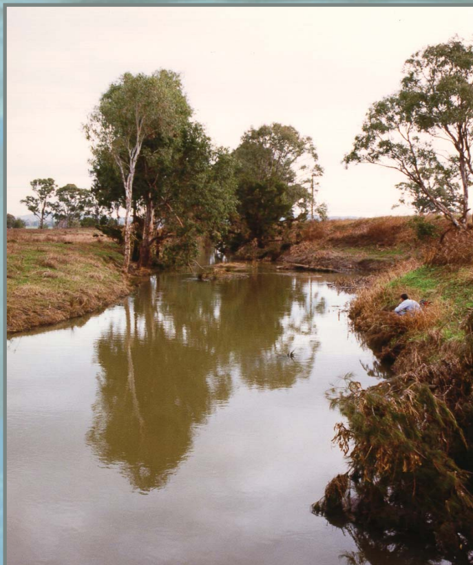
Results of tree clearing and desnagging upper Condamine