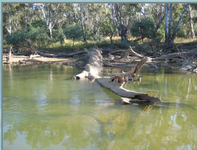
Snags on the Murray River near Yarrowonga

Riparian areas and vegetation provide habitat and nutrients essential for healthy fish populations, together with shade and a buffer for waterways. Riparian rehabilitation activities could include weed management and revegetation, as well as the protection of remnant riparian vegetation.