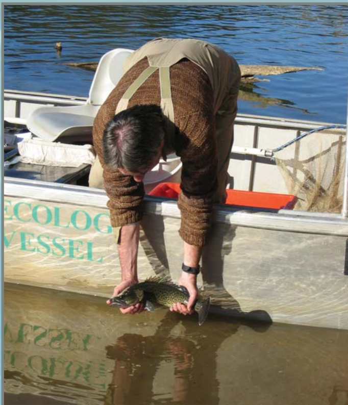
Habitat rehabilitation has been shown to benefit threatened species such as Trout cod

Demonstration reaches do not involve a reduction in access to, or use of, the river or riverbanks.