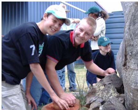
School of Total Education students, Making ochre at Gunningurru