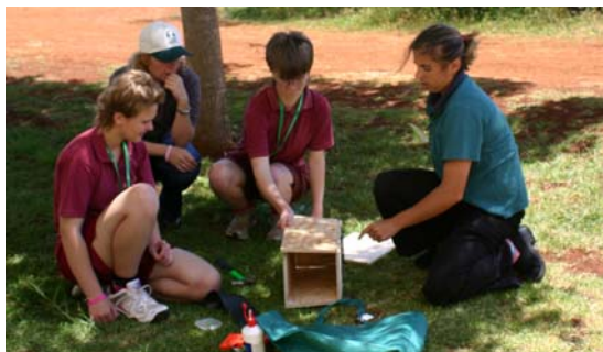
Clifford Park Special School students making a Sugar Glider box