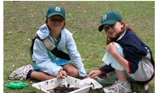
Surat State School students studying waterbugs