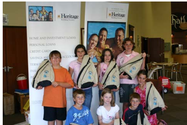
Murray's Bridge State School students with Conference satchels

Channel Ten ran a story on the conference, interviewing students, teachers and organisers. Radio coverage included a number of interviews on ABC Southern Queensland, and 4GR. Mention of the conference was also made in many school newsletters.