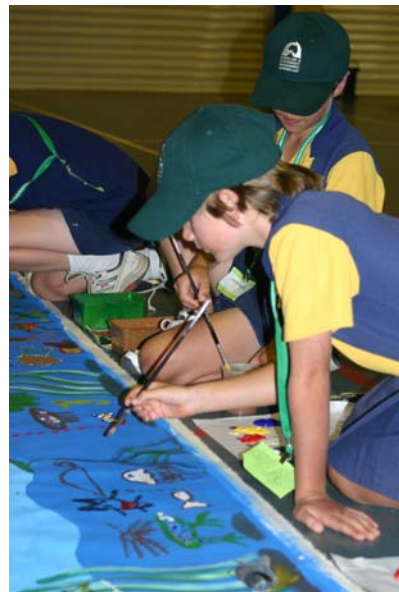
Kindon State School students painting stories of the catchment