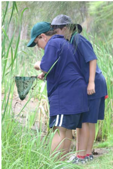
Murray's Bridge State School students searching for waterbugs

In terms of fulfilling the above mentioned objectives, the collected surveys and observations made throughout the event indicate that these aims were comprehensively met. QMDC is proud to have been able to provide this environmental education opportunity to students and teachers across Queensland. We gratefully acknowledge the support, both financial and in-kind, of all sponsors and assisting organisations. Assistance provided with presenting activities and providing expert advice was also invaluable. Finally we would like to acknowledge the inspiring group of students and teachers who made the conference such a success. It was truly encouraging to see so many committed and passionate individuals.