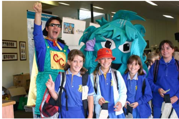
Captain Catchment and Ballandean State School students