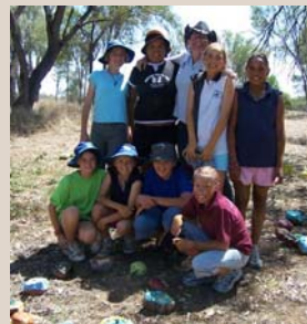
Mitchell State School senior students

The figures for increased participation and involvement of rural and remote children in Discovering Landcare Conference are: 2005 - 5 Indigenous student participants 2006 - 67 Indigenous student participants, 7 Elders and 12 Adults.