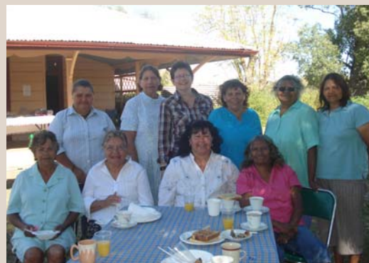
St George, Goomeri, Gungarri, Manandanji & Yuwallaaray

Elder women are keenly planning their Second Steering Committee meeting, which is scheduled for 9 December 2006 in Goondiwindi. Traditional Owner Goomeri Elder women are planning as cultural hosts of this meeting, to share natural and cultural resource initiatives, which their community are driving. The Indigenous Program of Border Gwydir and their Elder women community members are invited to participate and contribute to the Steering Committee meetings.