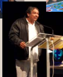
Discovering Landcare Conference (clockwise from left)