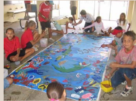
Toomelah Public School middle years Students

Thirri-li yana-a is an Indigenous youth involvement strategy, which commenced in early September 2006. In the lead up to Discovering Landcare Conference 2006, three Cultural Connection (Water) workshops have been conducted across the region. Participation in these workshops included 70 children, 12 Adults and 7 Elders.