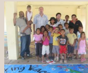
Toomelah Public School Pre school - Year Two students

The Indigenous Program, QMDC Inc. is partnering with Border Gwydir CMA Indigenous Program to deliver an Oral History Workshop series throughout the region and border areas. The first two Oral History workshops are scheduled for 22 & 23 November 2006.