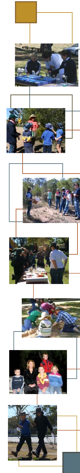
Participants in the 2008 Discovering Landcare Forum & Property Planning field day.

The competition is open to youth aged 12-18 years. There are two ways in which they can enter: They can write an essay in the form of - "A Letter From The Future" or They can enter a photo in the - "Natural Australia Photo" competition. There will be two winners chosen and both will win a trip for two to Borneo. To enter and for more information go to www.wwf.org.au/competition . Competition opens on the 5th October and closes on 20th October 2008.