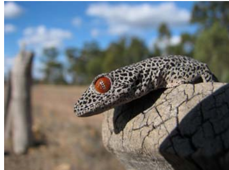
Above: The golden-tailed gecko is one of the species covered by the Reptiles of the Brigalow Belt information kit.

A reptile identification workshop was held at the Myall Park Botanic Garden, Glenmorgan on 4 October to launch a new threatened species toolkit. The workshop included an early morning bird walk as well as reptile species and habitat identification activities and was attended by over 70 community members.