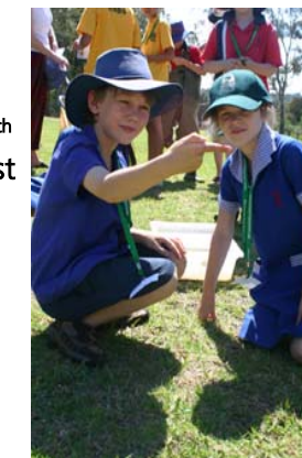
Discovering the wonders of waterbugs, DLC 2005

There have been several enquiries about accommodation for this years conference. We are happy to help arrange accommodation as we did last year. The rate last year was $25 per person for bed and breakfast at Camp Toowoomba, a dedicated school facility. Please let me know as soon as possible if you will require accommodation.