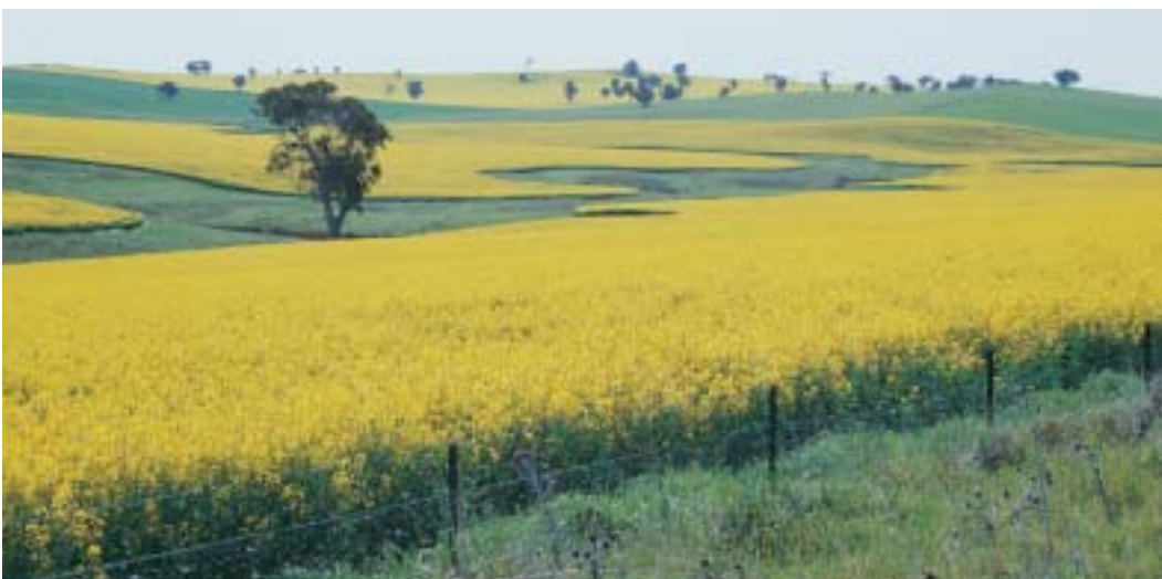
Canola crop with a single tree left marking the riparian zone — in this situation a riparian filter strip could be used to protect the ephemeral stream from any soil lost during crop establishment.

By its very nature, riparian land is fragile, and performs a vital link between land and water ecosystems. Its productivity also makes it vulnerable to over-use and to practices that cause it to deteriorate, creating additional problems. Good management of riparian land is not a substitute for good land management practices elsewhere in a catchment. However, it is an essential component of sustainable management of a property or landscape that can yield numerous benefits.